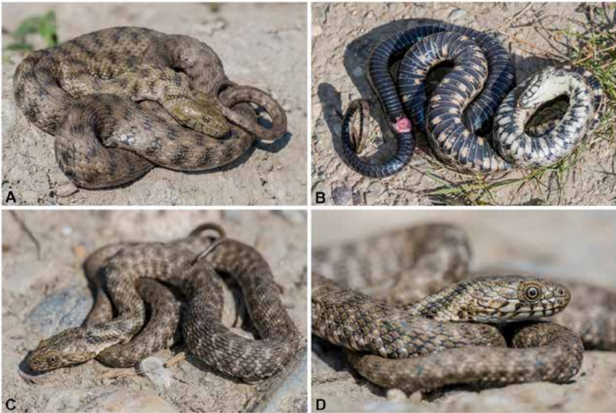
Fig. 3. Individuals of Natrix tessellata from the location in Lisková. (A) Adult female dorsal view. (B) Same individual in ventral view. (C) Overall view on juvenile individual. (D) Detail of the head on the same individual.

Coronella austriaca (Laurenti 1768), and Vipera berus (Linnaeus 1758) were also observed.