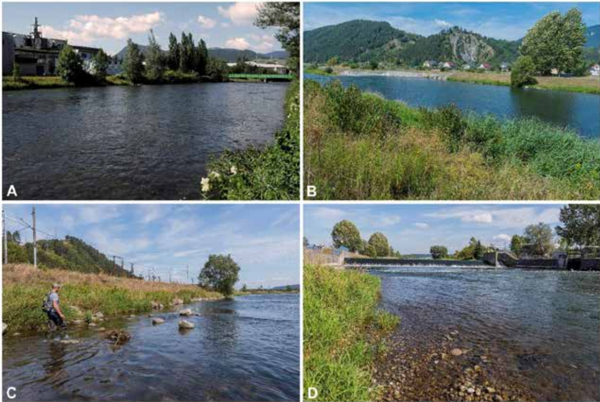
Fig. 2. Locations and habitat of Natrix tessellata near Ružomberok. (A) Location in Ružomberok where the first individuals were observed. (B) (C) (D) View on the habitat near Lisková village.

adult male and one dead adult individual near the dam Liptovská Mara (the largest dam in Slovakia; 49.093°N, 19.486°E; 554 m asl; loc. 5). We had attempted to find this species in Liptovská Mara during July 2017 but were unsuccessful. However, as these locations are close to each other, we expect the Dice Snake to occur throughout this part of the river. The locations described herein represent the currently highest elevations for N. tessellata in Slovakia. We also surveyed apparently suitable and lower locations between Ružomberok and to the west as far as Kral'ovany where any Dice Snakes were recorded.